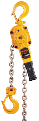
2 3/4 Ton